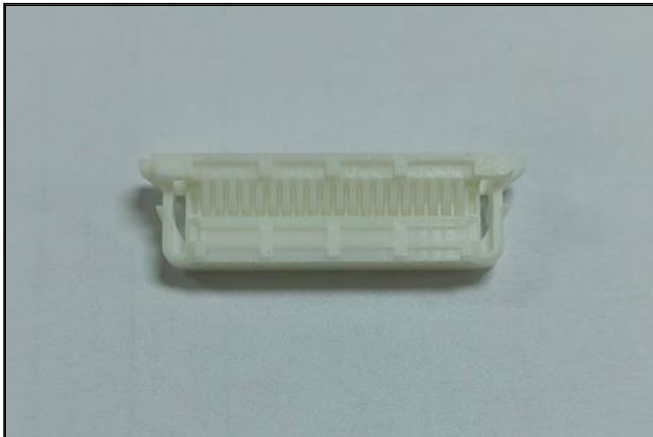
New body: Color-White