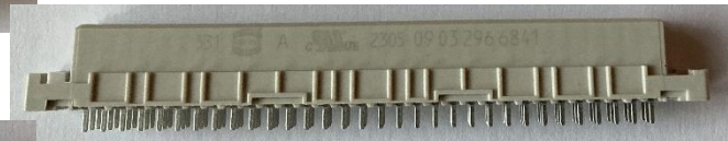
Example of new THR & NFF product