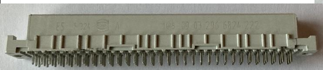
Example of old NFF product