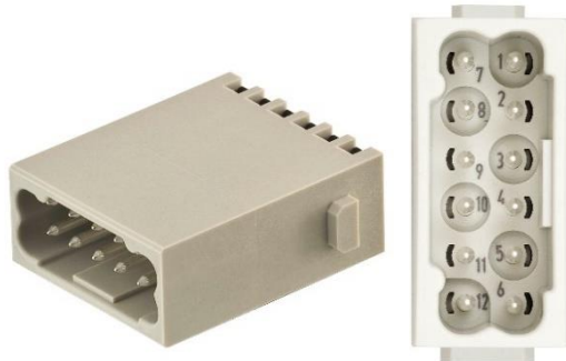
Illustration of the module and mating side before change

Detailed illustration of one contact cavity